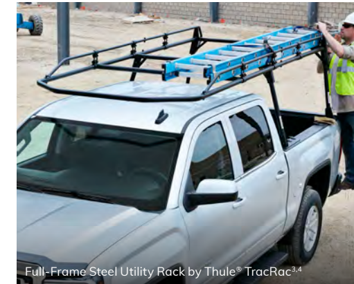
Full-Frame Steel Utility Rack by Thule® TracRac 3,4