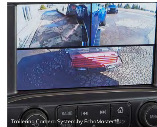
Trailer Camera System by EchoMaster 7,8