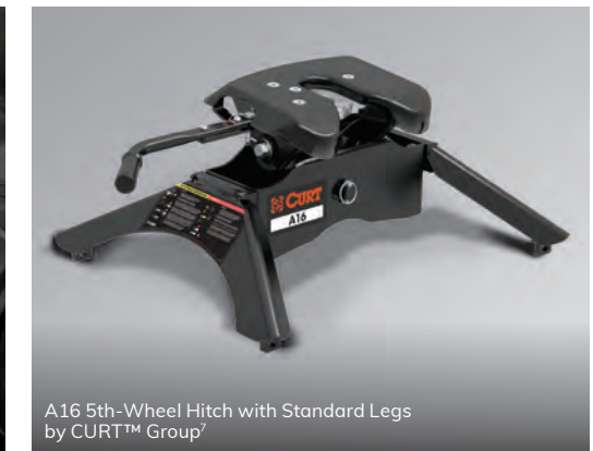
A16 5th-Wheel Hitch with Standard Legs by CURT™ Group 7