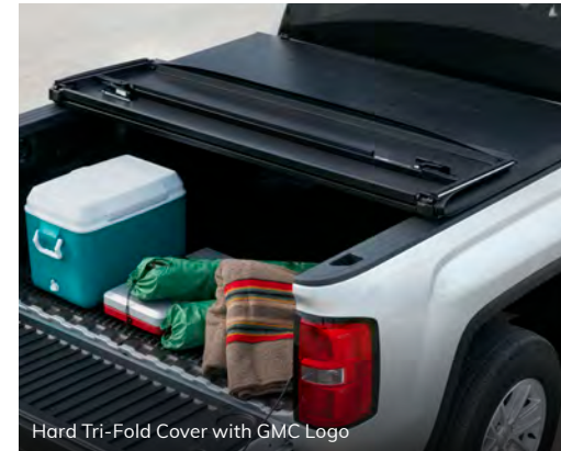
Hard Tri-Fold Cover with GMC Logo

FOR THE FULL LINEUP OF ELIGIBLE BUSINESS CHOICE ACCESSORIES, SEE YOUR DEALER.