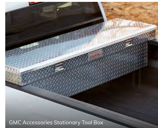
GMC Accessories Stationary Tool Box