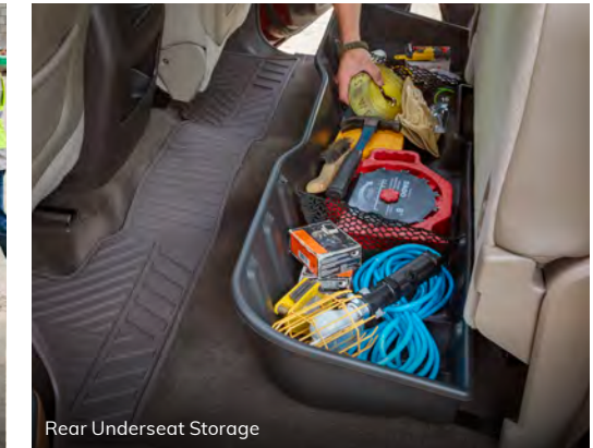
Rear Underseat Storage