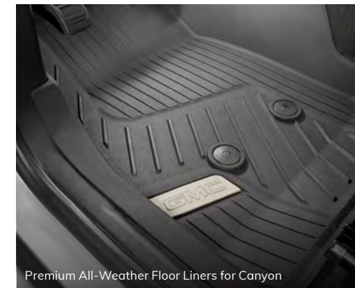
Premium All-Weather Floor Liners for Canyon