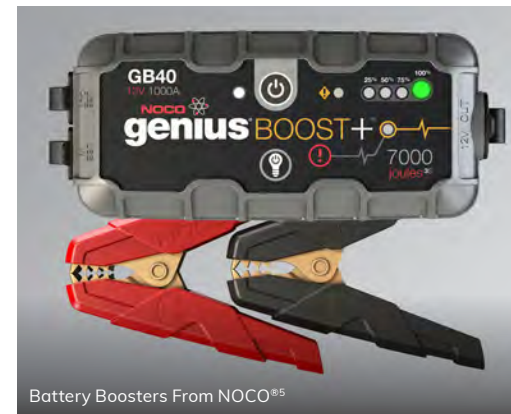
Battery Boosters From NOCO 5,6