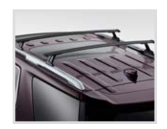
ROOF RACK CROSS RAILS

Option Code: VRV LPO Price: $295 Install Time: 0.7 Select color options, Front & Rear