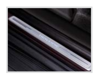
ILLUMINATED DOOR SILLS

Bright Silver (VQP) LPO Price: $350 Install Time: 0.2