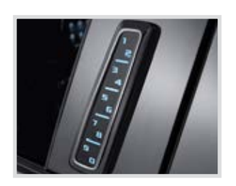
KEYLESS ENTRY SYSTEM Option Code: RDI LPO Price: $175 Install Time: 0.5