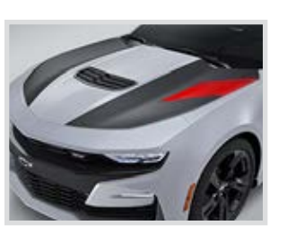
HOOD DECAL W/HASH MARK Black w/Red Hash Mark (SHU) Black w/Silver Hash Mark (SHS)