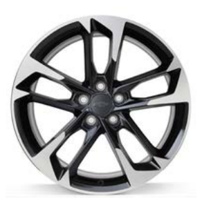
20 IN. WHEELS MACHINED FACE (56M) / (SKW) LPO Price: $1695 / $2895 Install Time: 1.5

20 IN. WHEELS GLOSS BLACK W/RED STRIPE (56H) / (SHL) LPO Price: $1995 / $3195 Install Time: 1.5