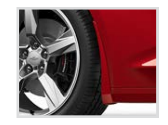
SPLASH GUARDS Option Code: VRV LPO Price: $295 Install Time: 0.7 Painted Splash Guards, Front & Rear, select color options