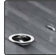
Ball stored, without rubber cover