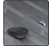
Ball protected with included cover