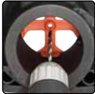
Simply drill up from under the bed