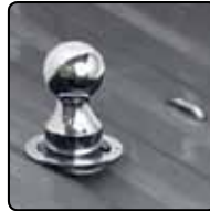
Ball up, ready for coupling