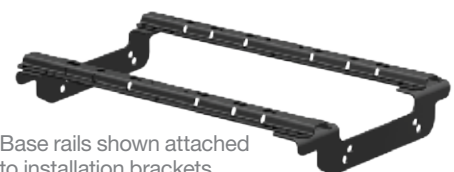
Base rails shown attached to installation brackets