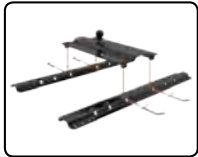
Attaches to 5th wheel rails