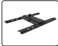
Bent plate provides 3" offset