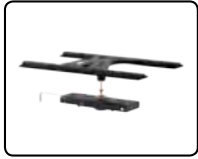
Replaces Double Lock trailer ball