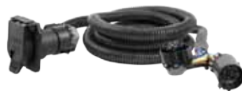
7-way electrical wiring extension also available individually, see page 3