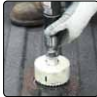
Use the pilot hole for error-free drilling