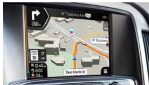
Rosen 8-inch Upgrade kit display shown