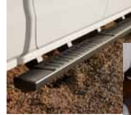
YOUR FREE ACCESSORIES