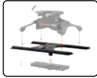
Quickly provides 5th wheel rails