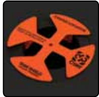
Exclusive center locator saves time