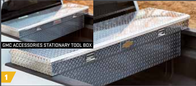
GMC ACCESSORIES STATIONARY TOOL BOX

Silverado HD • Silverado 1500 • Colorado • Sierra HD • Sierra 1500 • Canyon