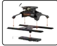
Accepts 5th wheel hitches and rollers