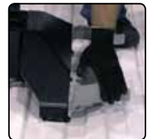
Close the anchor levers to lock the legs into place