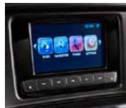
Chevrolet 4.2-inch display shown