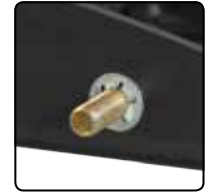
Retainer clips secure the bolts supporting the center section while attaching an installation kit