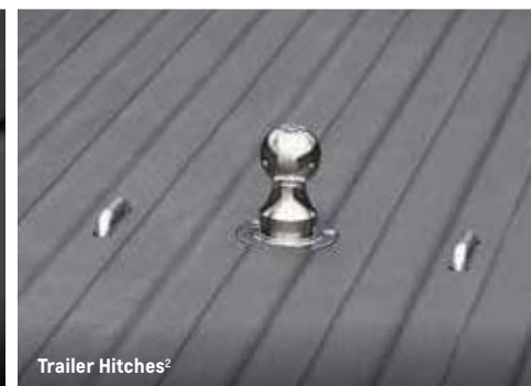
Trailer Hitches 2