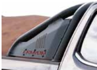
AVAILABLE GMC ACCESSORY: Bed-Mounted Sport Bar