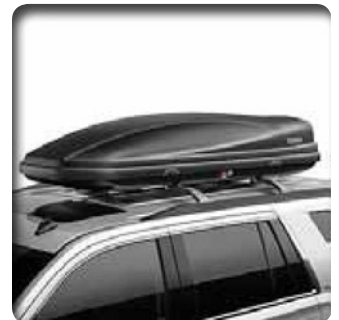
RACKS & CARRIERS