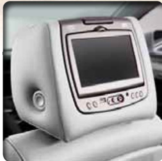
HEADREST DVD SYSTEM (UJ5)