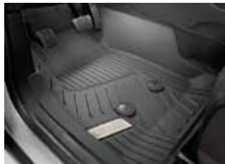
All-Weather Floor Liners