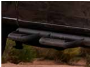
Black 3" Round Step Bars