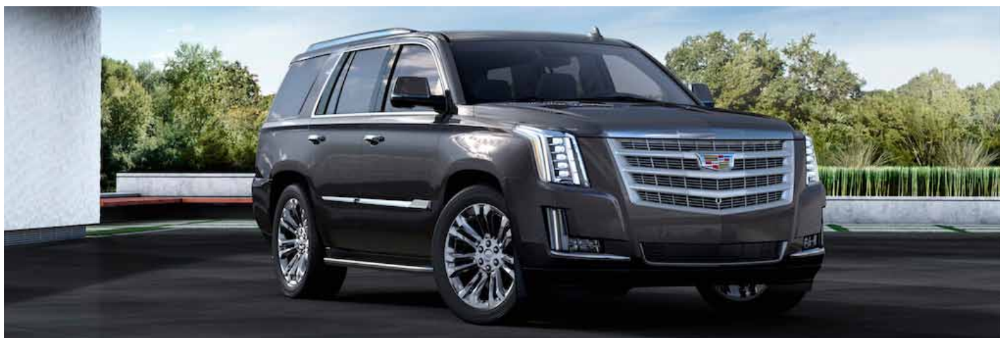
2017 Escalade featuring Radiant Package LPO PDV