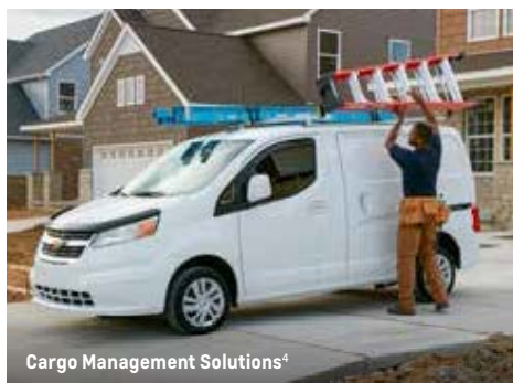
Cargo Management Solutions 4