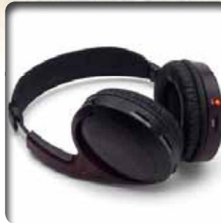
WIRELESS HEADPHONES (S1V)