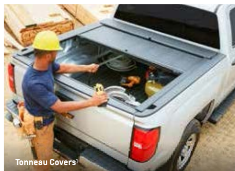
Tonneau Covers 1