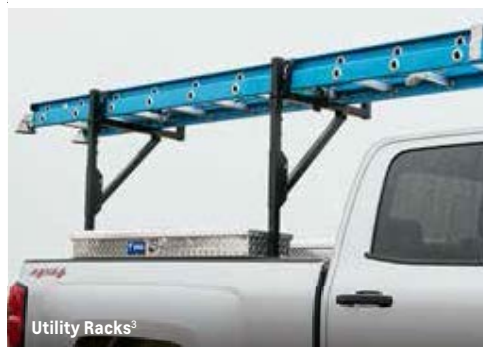
Utility Racks 3