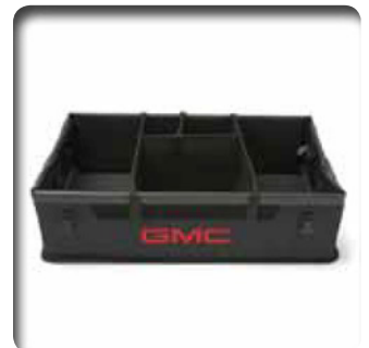
CARGO ORGANIZER (RWU)