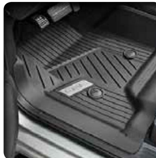
ALL-WEATHER FLOOR LINERS (RIA)