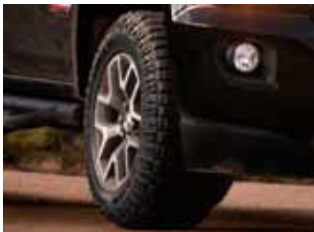
17-inch Goodyear Wrangler DuraTrac® All Terrain Off-Road Tires

INCLUDES CONTENTS OF THE ALL TERRAIN PACKAGE AND SLE CONVENIENCE PACKAGE, PLUS THESE FEATURES: