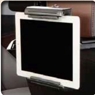
TABLET HOLDER (S1F)

This season, family-friendly accessories should top the list for SUV & crossover customers. These accessories will make holiday travels fun and convenient for the whole family!