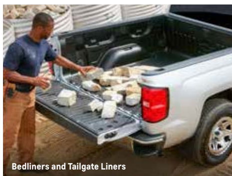
Bedliners and Tailgate Liners