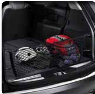
CARGO NET (W2D)