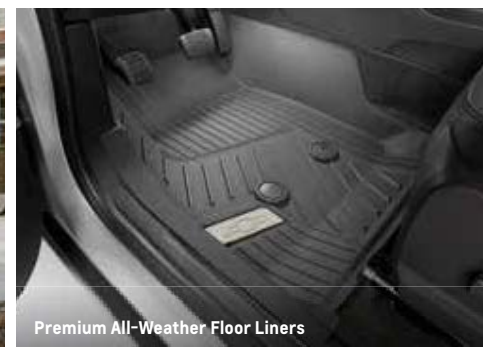
Premium All-Weather Floor Liners