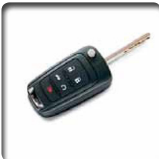
REMOTE START (S6P)