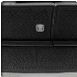
INTEGRATED CARGO LINER (CAV)