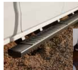
YOUR FREE* ACCESSORIES