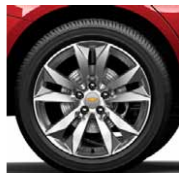
(SKY) 18-Inch, 5-Split-Spoke Cast Aluminum Silver-Painted Wheels

Southwest ADI 6550 Wuliger Way North Richland Hills, TX 76180