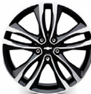
(SGZ) 19-Inch, 5-Split-Spoke Cast-Aluminum Machined-Face Wheels with Black Pockets