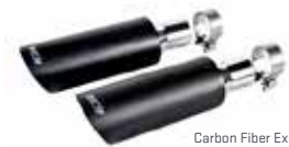
Carbon Fiber Exhaust Tip Kit