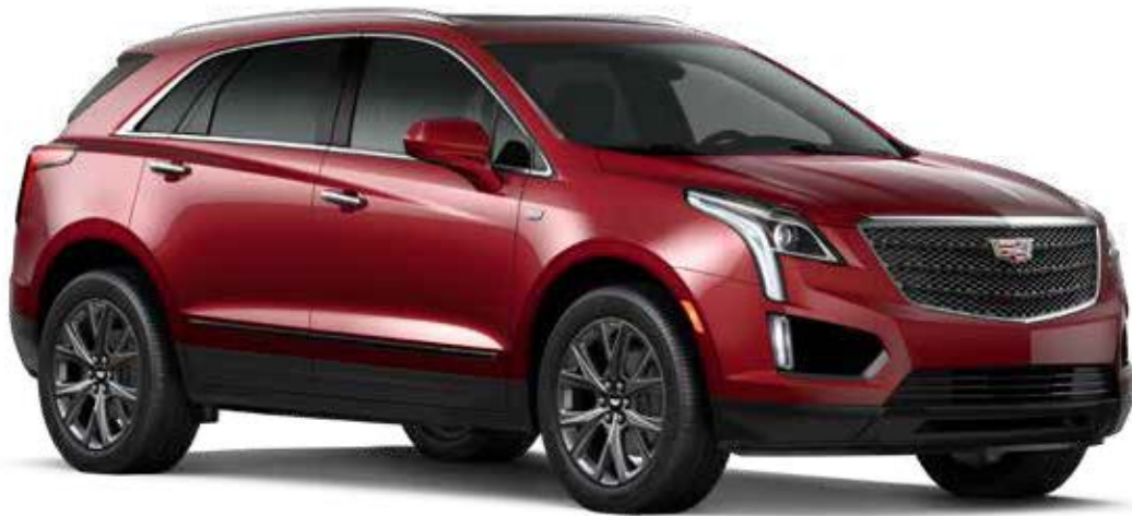
2018 Cadillac XT5 shown with Black Ice Chrome Grille, Bodyside Moldings, Fog Lamp Trim Grilles and 20-Inch 6-Split-Spoke Wheel. Preproduction model shown with optional equipment. Production model may vary.