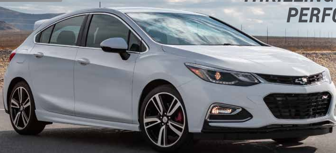
2017 Chevrolet Cruze Premier Hatch with available RS Package. Optional equipment shown.