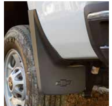
Front & Rear Molded Splash Guards, LPO VQK Labor 1.3 hrs.