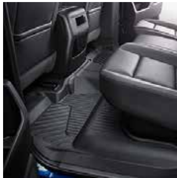
Front & Rear All-Weather Floor Liners, LPO RIA Labor 0.1 hrs.